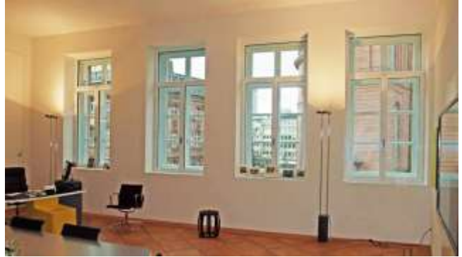
Aluminum window installed as a secondary window inside an office in Frankfurt.