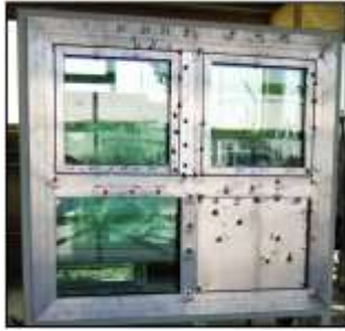
Ballistic test of the window series S6 energy Saving : French window casement was shot with a Magnum Cal 357 and a Rem. Magnum Cal 44 (level: FB4/BR4-NS).