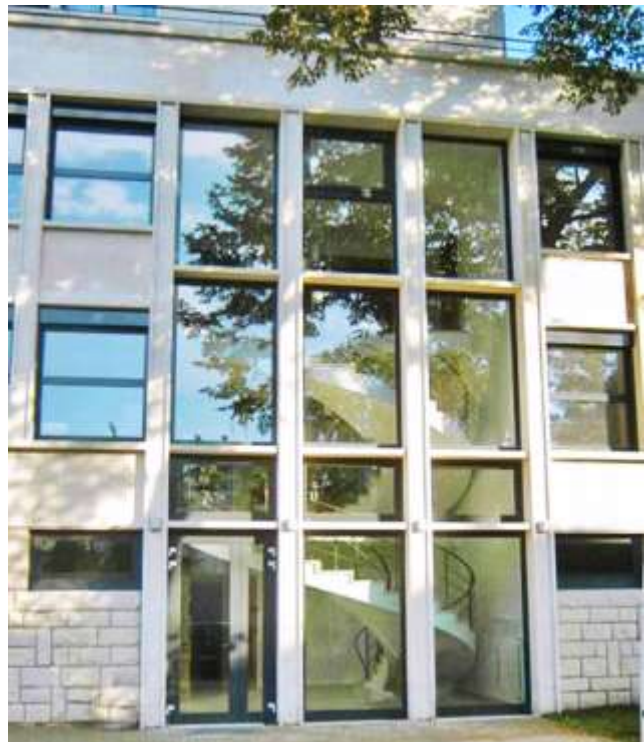
Combination of different window variations incl. aluminium door.