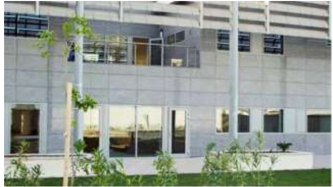
SÄLZER security window installed in an embassy in Asia.