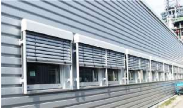
Blast-resistant windows in a petro-chemical facility (petro-chemical).