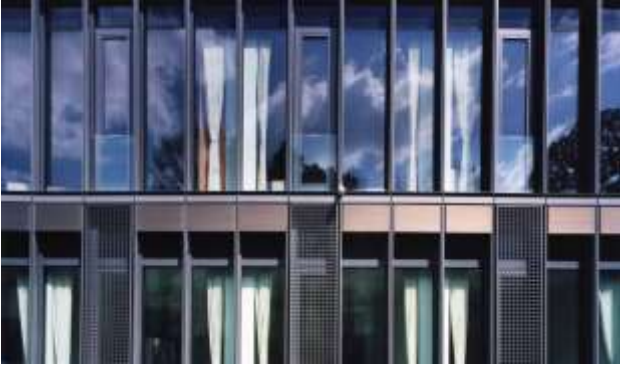
Security window seamlessly integrated into a security curtain wall.