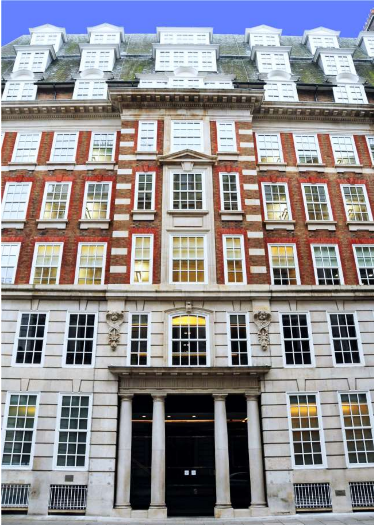
The SÄLZER security windows were manufactured according to heritage building. Historic design and modern technology "invisible security".