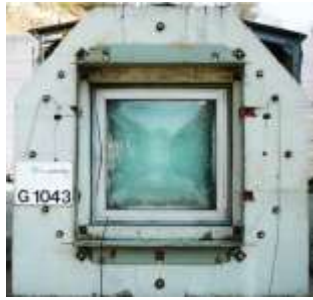
Shock tube test: a window series S6 energy Saving was tested with a positive peak pressure of 50 kPa (0.5 bar) over 1 second.