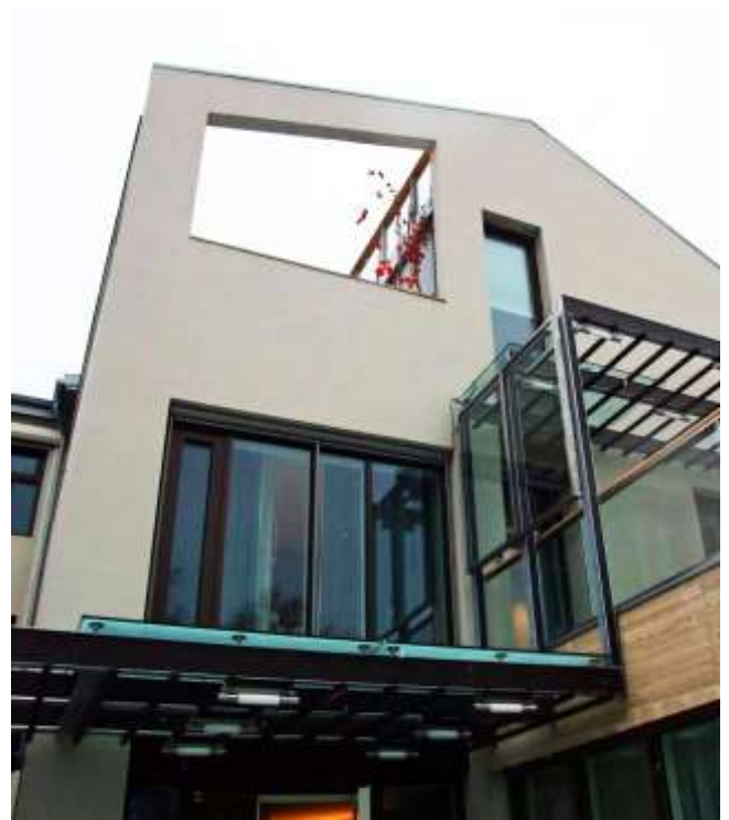
No design restrictions for the architects and builders - customized security solutions.

Tested according to the Australian standard for structural design against wind actions AS/NZS 1170:2:2011 and according to the technical note no.4 by the James Cook University Australia*.