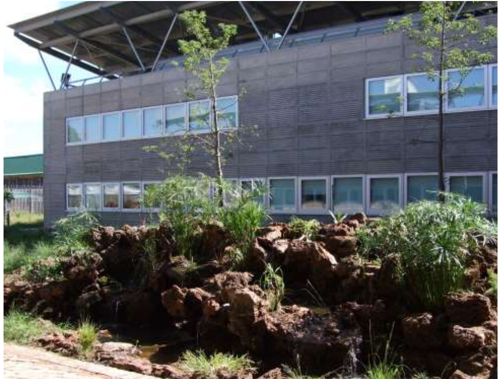
High security windows installed in an Embassy.

The aluminum windows of the series S2 energy saving and S6 energy saving are durable, corrosion resistant and low-maintenance. They provide security to the highest resistance classes and are characterized by excellent thermal insulation.