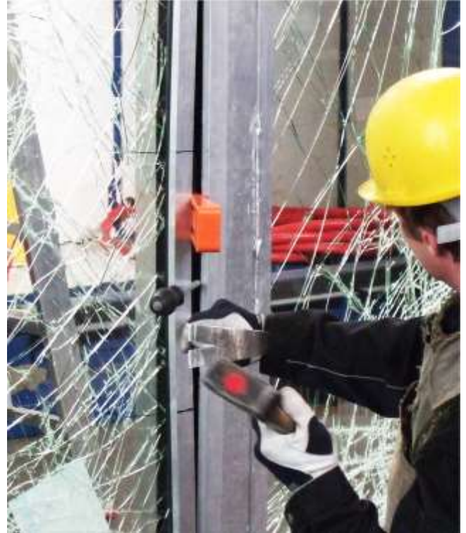
Forced entry test, resistance level RC4.

Often simultaneous protection against forced entry, bullets and / or explosion is required. Exactly for these combined requirements the SÄLZER aluminum windows provide the ideal solution.